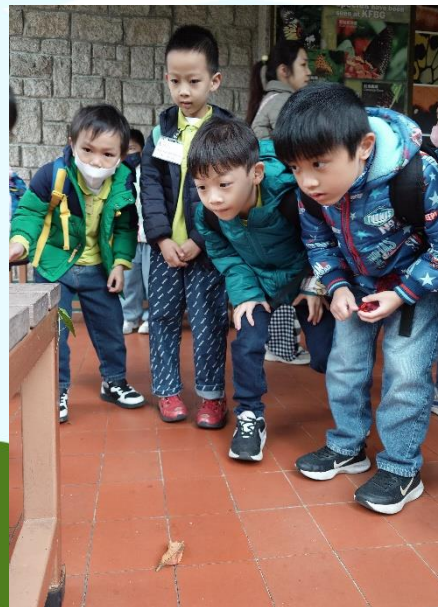
Children observed various animals intently.