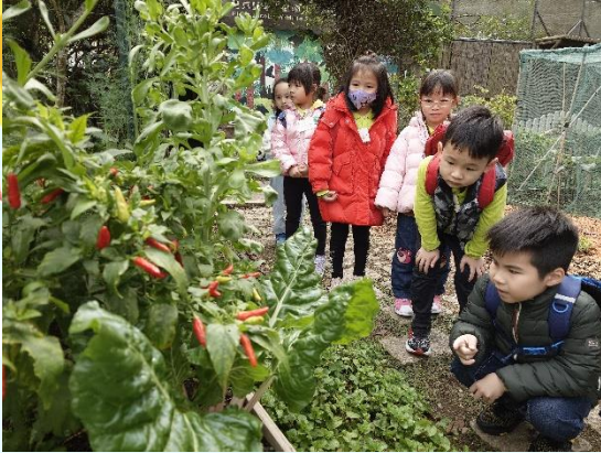
Children appreciated various plants carefully.