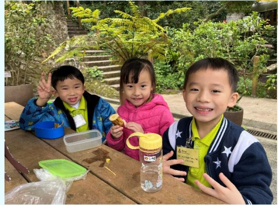
Children enjoyed the fun of picnics.