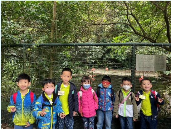
Children took photos with animals.